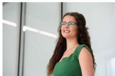
Maïke van Niekerk, 2017 (Health)